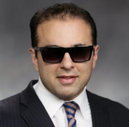
CYRUS HABIB Lt. Governor, WA