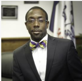
QUENTIN HART Mayor of Waterloo, IA