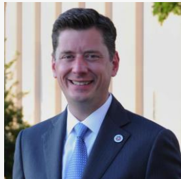
DAVID HOLT Mayor of Oklahoma City, OK