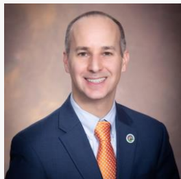
ANDY SCHOR Mayor of Lansing, MI