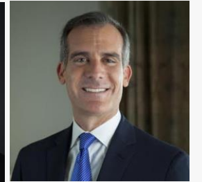
ERIC GARCETTI (CHAIR) Mayor of Los Angeles, CA