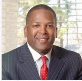
STEVE BENJAMIN Mayor of Columbia, SC