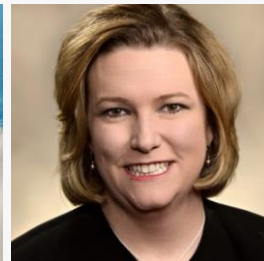
NAN WHALEY Mayor of Dayton, OH