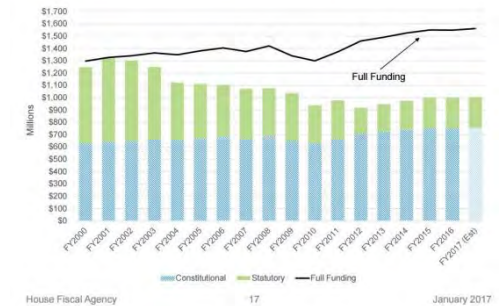
Total Revenue Sharing Payments to Cities, Villages, and Townships