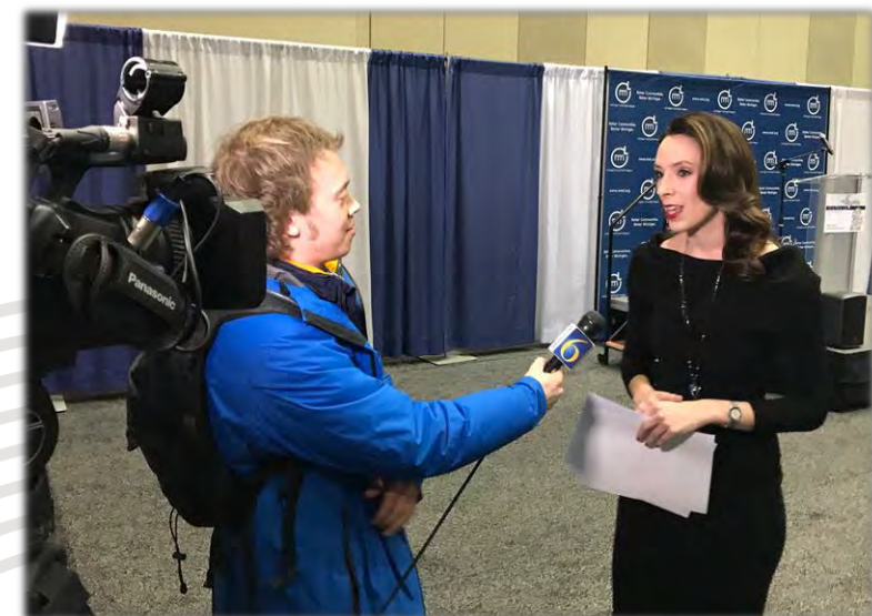
Photos from news conference at 2018 CapCon about 16/50 Project