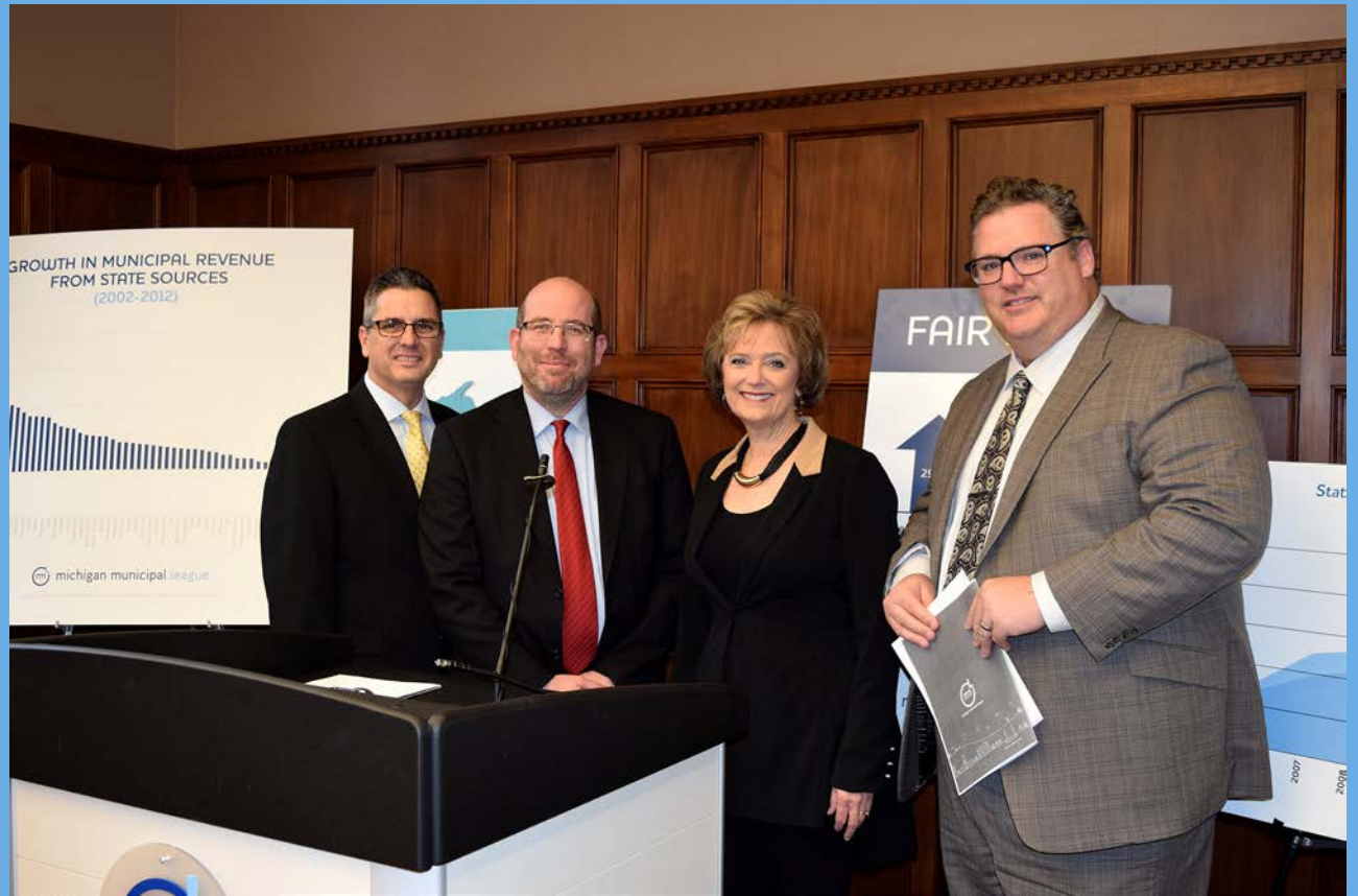
Press Conference in Lansing