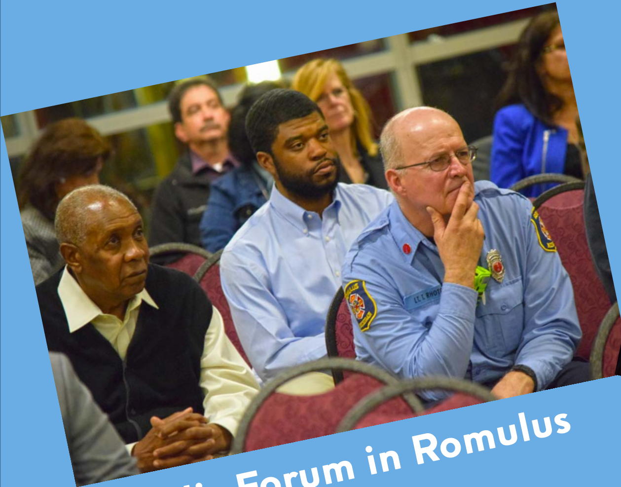
Public Forum in Romulus