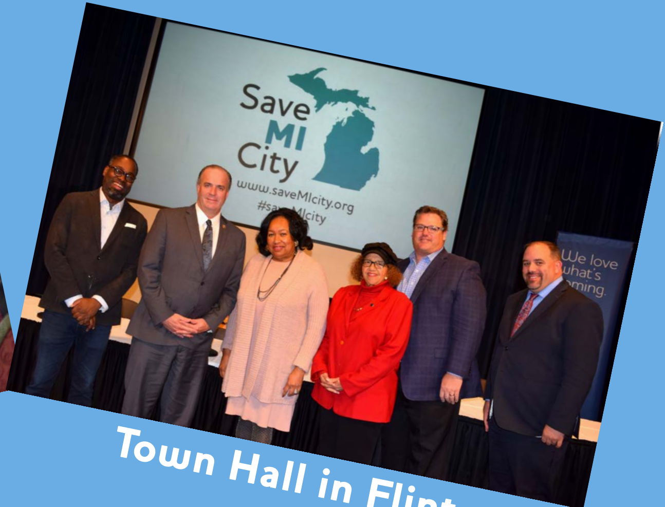
Town Hall in Flint