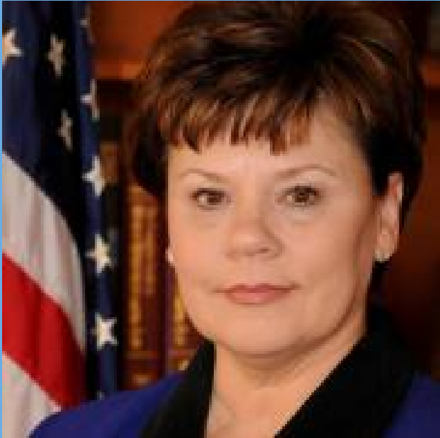
Burton Mayor Paula Zelenko